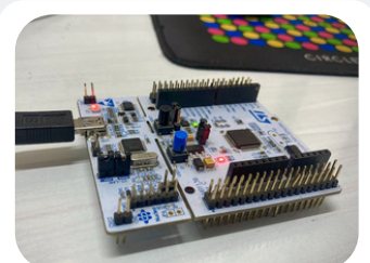
STM 32 Arm Cortex