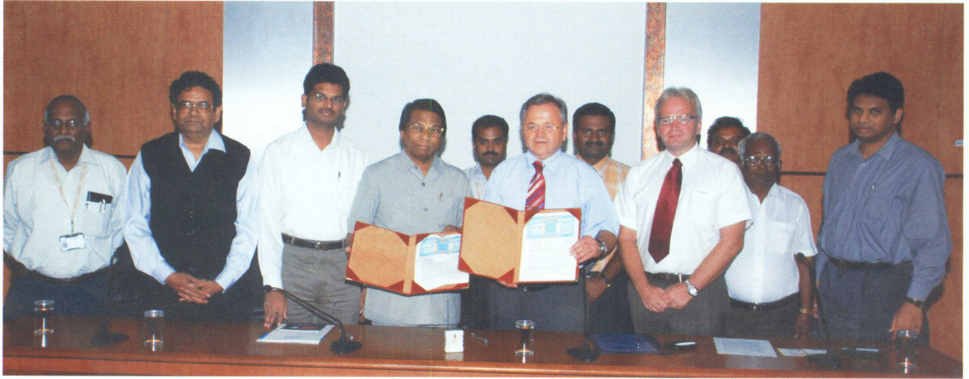
Signing of MoU with Kramski on 22 - 01 - 2008

Kramski GMBH , a German based SME is setting up a manufacturing unit in Vellore. The company will be investing around Rs.10 crores and there is an employment potential for about 100 people. Considering the synergy, VIT TBI has accepted Kramski's request for providing soft launching of their venture in Vellore. VIT TBI will offer a complete range of Business Incubation support to facilitate the launch of this business.